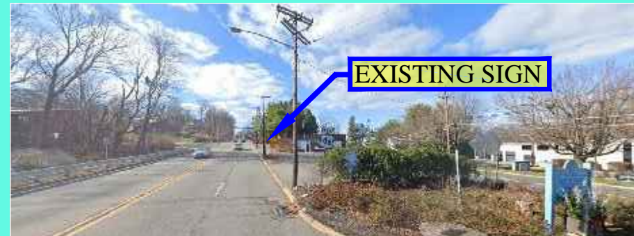
VIEW WESTBOUND US ROUTE 46