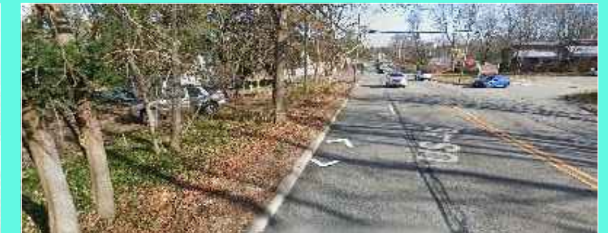
VIEW EASTBOUND US ROUTE 46